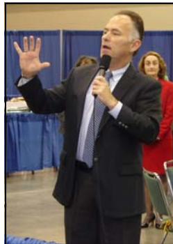
Pacers' Coach Jim O'Brien "tips off" Indy Homeless Connect 2008 with a volunteer pep rally!