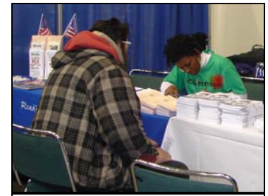
A volunteer helps a homeless veteran receive benefits.