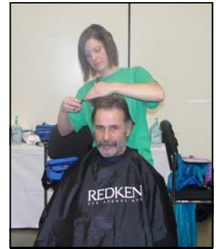
A neighbor receives a haircut at the third annual Indy Homeless Connect.