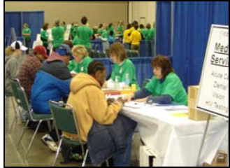
A busy Medical area provided acute care, dental and vision screenings and foot care.

On January 30 th , the Coalition for Homelessness Intervention and Prevention hosted the third annual Indy Homeless Connect (IHC) at the Indiana Convention Center. Made possible by over 45 service providers, municipal agencies, and the City of Indianapolis, the event offered much needed services, support and care to nearly 600 homeless individuals. Homeless neighbors were able to access an