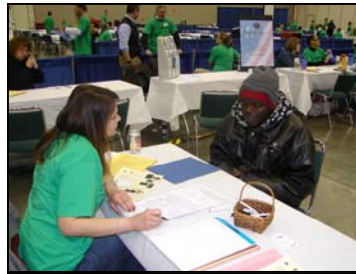
A homeless neighbor and housing counselor work together in the Housing area.

Not only was IHC a day to offer services and caring, it was also an opportunity to raise awareness about homelessness in Indianapolis. It was a day to bridge the gaps between our homeless neighbors and the community to which we all belong.